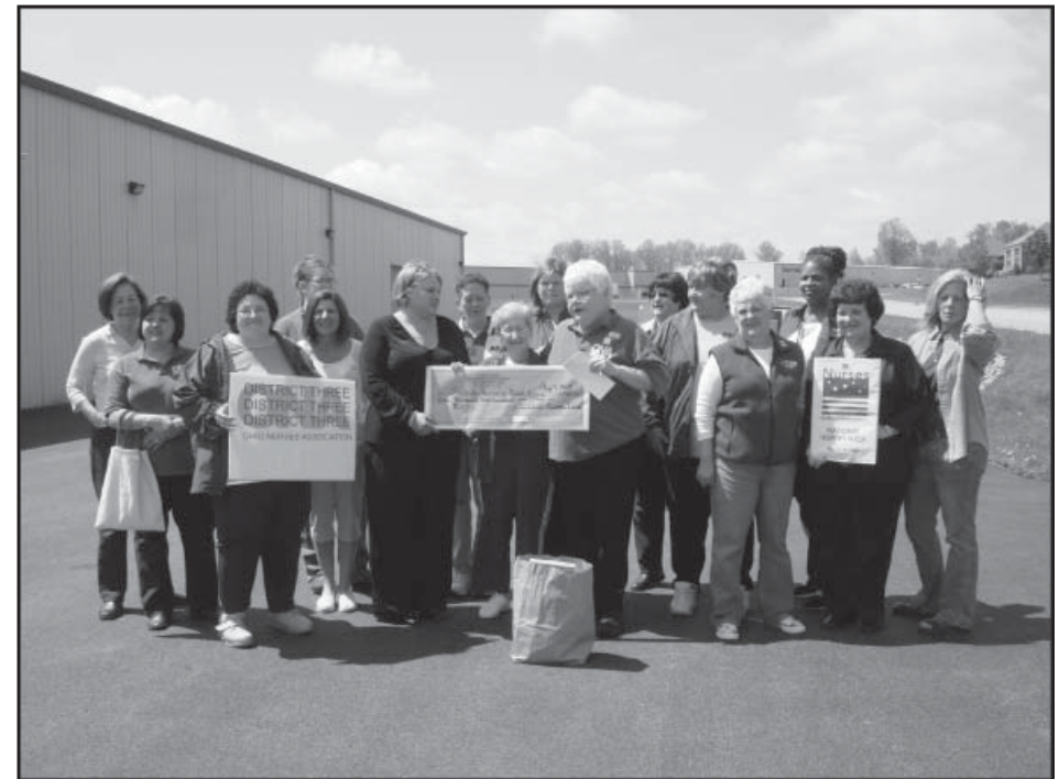
(See Picture Below of May 2009 event at the Second Harvest Food Bank)

Last year, many of our RNs engaged in this activity and all who were there said, hands down, that they achieved far more than they gave in doing this worthy service. Thank you in advance for signing up to give service at 2nd Harvest Food Bank, donating money or nonperishable food to this wonderful endeavor to be held on May 11, 2010 from 12 noon to 2p.m..